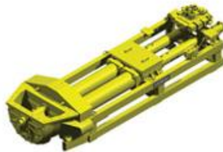
KSP with Rock valve system