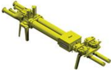
KSP with dual outlet