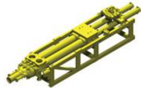
KSP with horizontal configuration