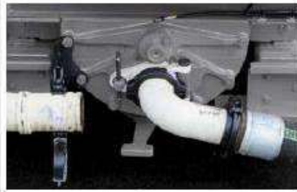
Rotating outlet (for pumping with hoses)