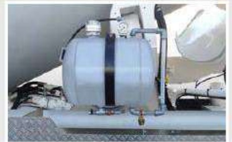
Admixture system (compressed-air version)