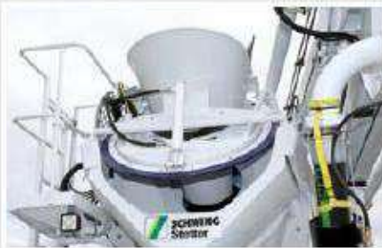
Drum cover (3/4 or full lock)