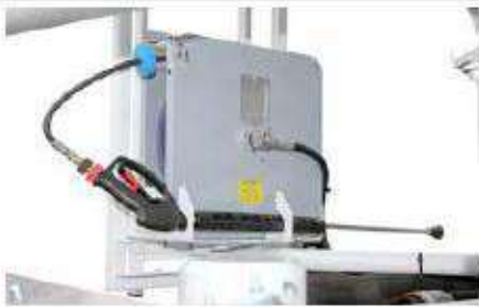
High pressure cleaner