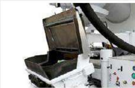
Covering for hopper in position "External filling"