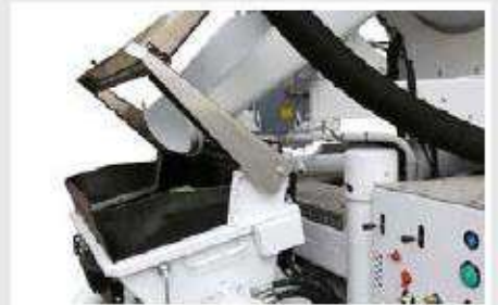
Covering for hopper in position "Own + external filling"