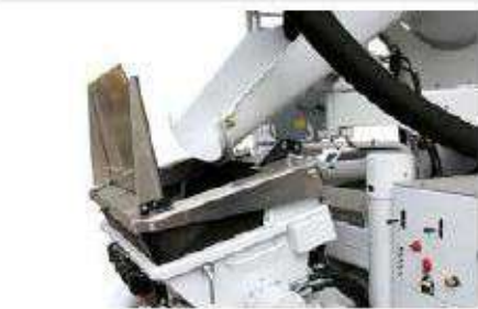
Covering for hopper in position "Own filling"